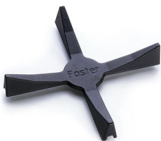
Cast iron wok support 9601 668